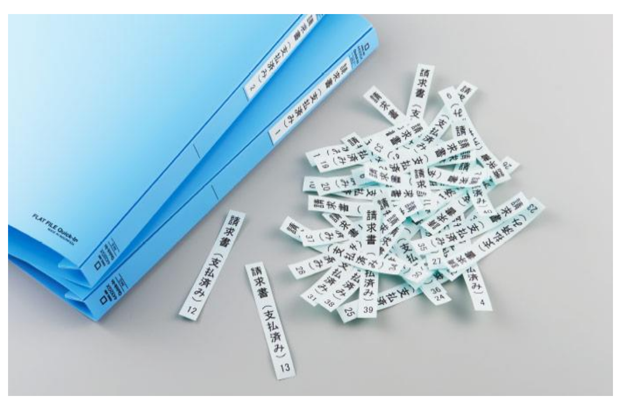
Used for pasting files for equipment storage and credit management