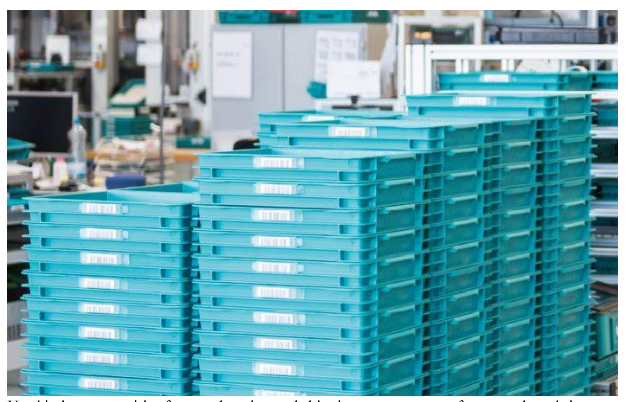
Used in large quantities for warehousing and shipping management of parts and work-in-process goods!

Great value! Example of cost comparison when creating 10,000 10cm labels